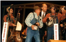
TENNESSEE MAFIA JUG BAND